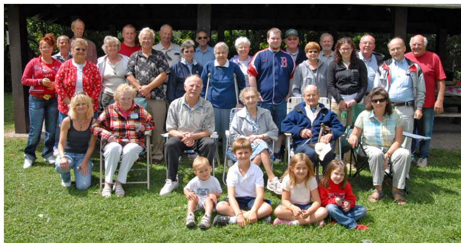
2007 Vincent Reunion - Hopefully we will see a big turnout this year.

Additional copies of the book The Vincent Family , Third Edition (1998) will be available at $35.