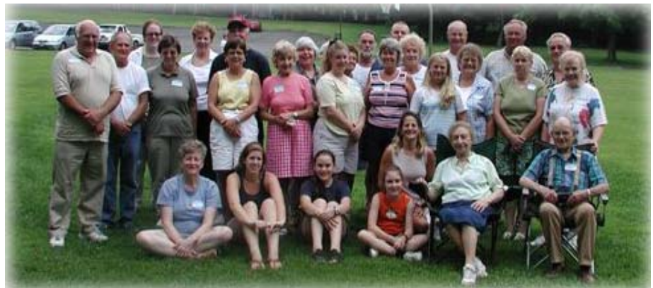
2003 Vincent Reunion - Hopefully we will see a big turnout this year.

Additional copies of the book The Vincent Family , Third Edition (1998) will be available at $35.